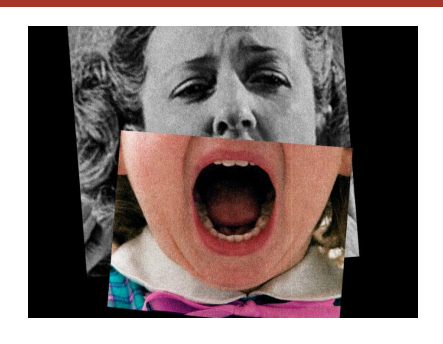
From The Atlantic What America Asks of Working Parents is Impossible