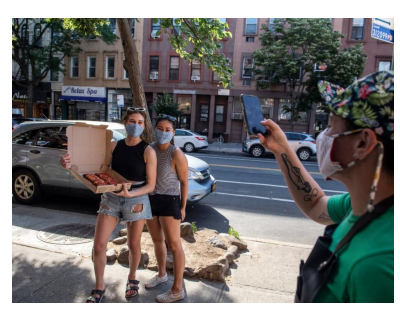
From The New York Times The Rise of Side-Hustle Cooking Businesses