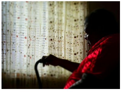
From The Times Union Albany High School Students Wins Congressional Photo Award