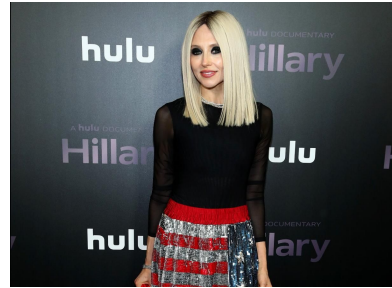
From Business Insider LinkedIn for Creatives