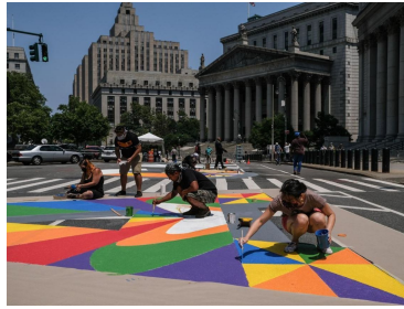
From CityLab Amid Crisis, A Renaissance for Street Art