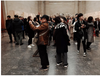
From Vox If Museums Want to Diversify, They're Going to Have to Change. A Lot.