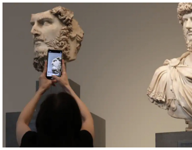
From The Washington Post Appointing a "Dr. Fauci for the Arts"