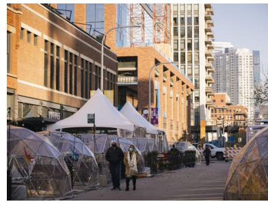
From CityLab The Indoorification of Outdoor Dining