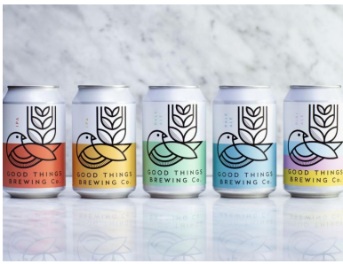
From Creative Boom The Biggest Trends in Graphic Design 2021