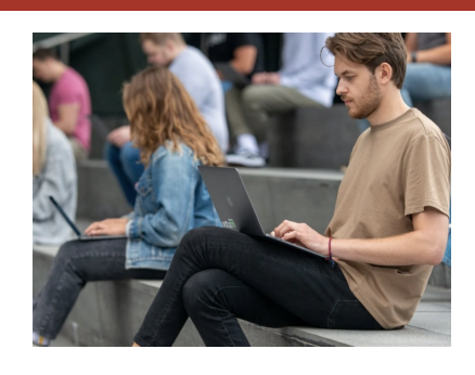
From Mailerlite 5 Email Marketing Trends To Help You Plan 2021 Campaigns