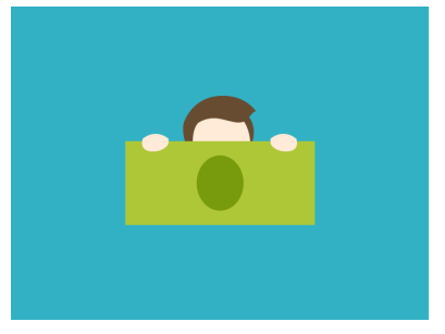
From Freelancers Union How the New Relief Bill Will Impact Your Taxes