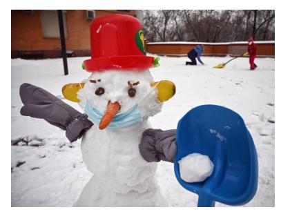
From City Lab How to Socialize in the Cold Without Being Miserable