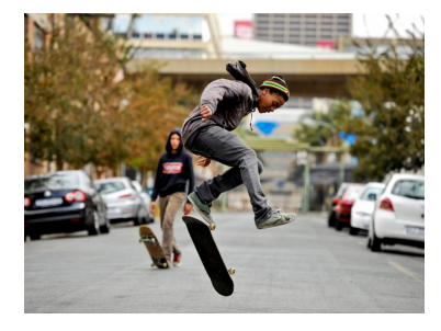
From Maverick Life Skateboarding's Influence on the Creative Industries and Beyond