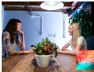
From Artwork Archive New Podcast Explores Life As a Working Artist