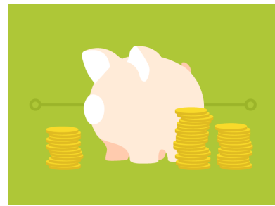
From Freelancers Union Covid-Related Tax Deductions for Freelancers