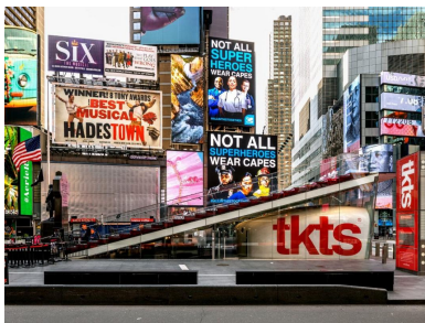
From The New York Times NYC's Arts & Recreation Employment Down 66%