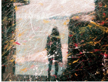
From UNESCO UNESCO Investigates Gender Equality in the Creative and Cultural Sectors