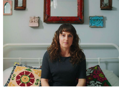
From MarketingWeek Two-Thirds of European Female Marketers Considered Quitting During COVID