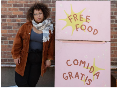
From Time Magazine Local Woman Featured in Time Magazine