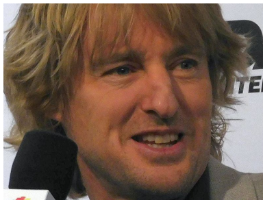
From Saratoga Living Owen Wilson Film Project On Location in Saratoga