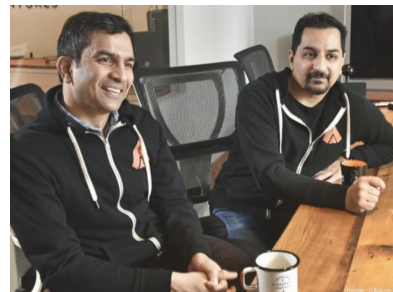
From Albany Business Review Cap Region Game Studios Score National Awards