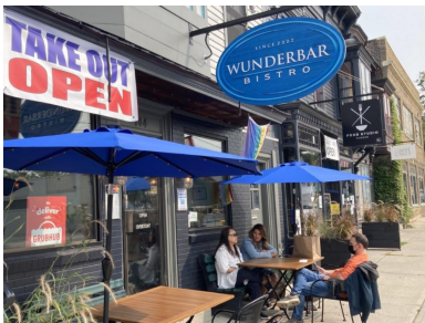
From Hudson Valley 360 Small Business is Booming in Columbia and Greene Counties