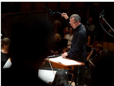
From The Saratogian Albany Symphony Wins Its Second Grammy