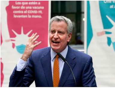
From New York Times NYC Creates $25 Million Program to Put Artists Back to Work