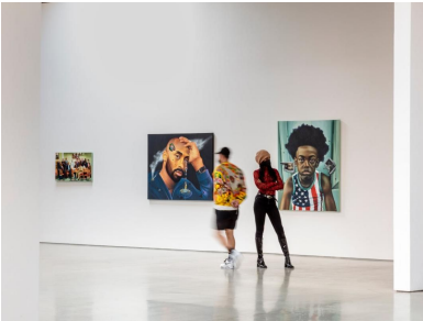
From New York Times Gallery Features Only Artists of Color